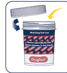
Remove lid and collect sample