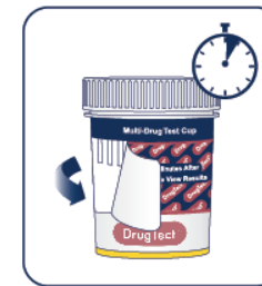
Wait 5 minutes. Peel label to view results