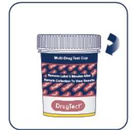
Secure the lid onto the cup